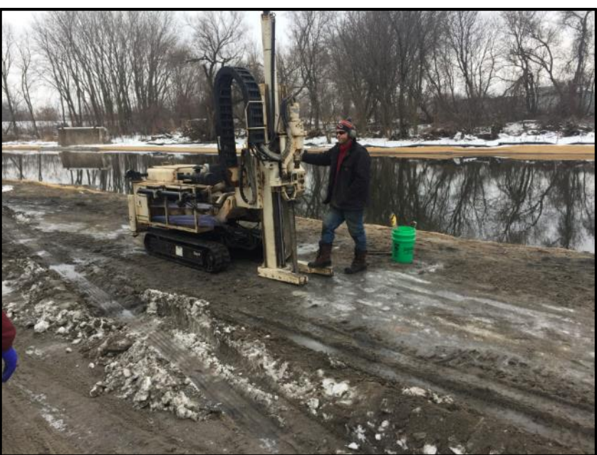
Sampling former access roads