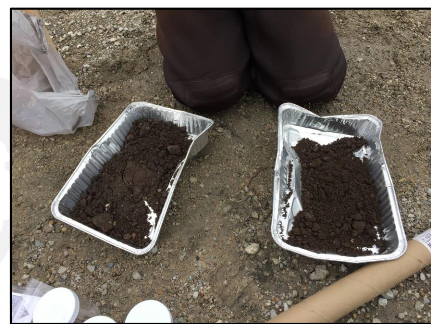
Preparing samples for analyses