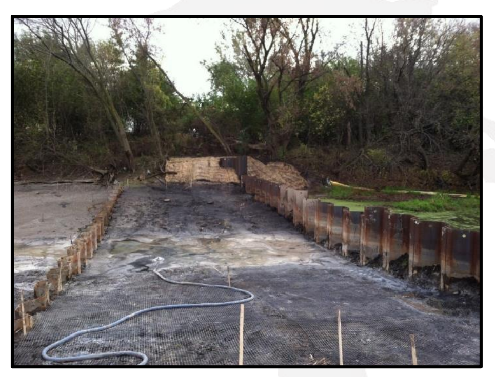
Completing capping at state line boundary