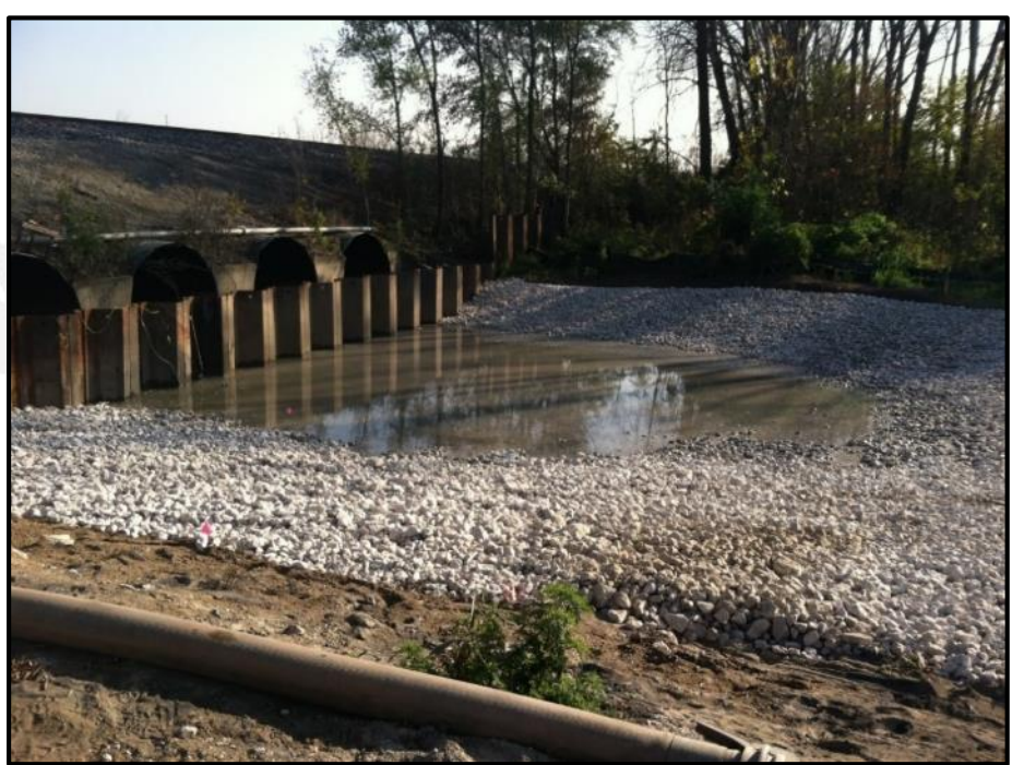
Scour protection west of railroad culverts