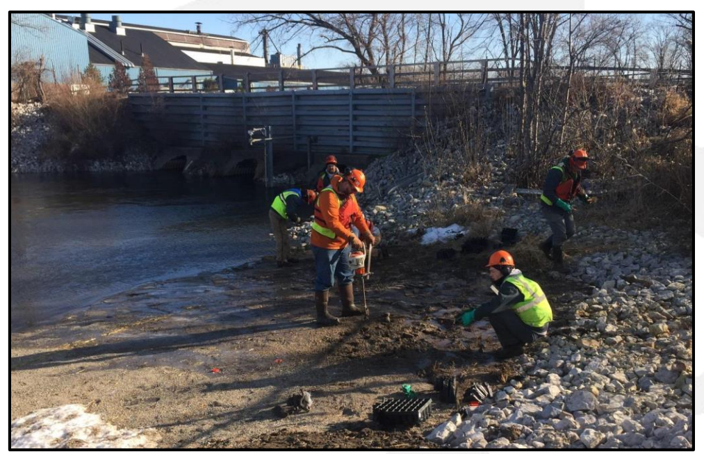
Planting wetland plant plugs