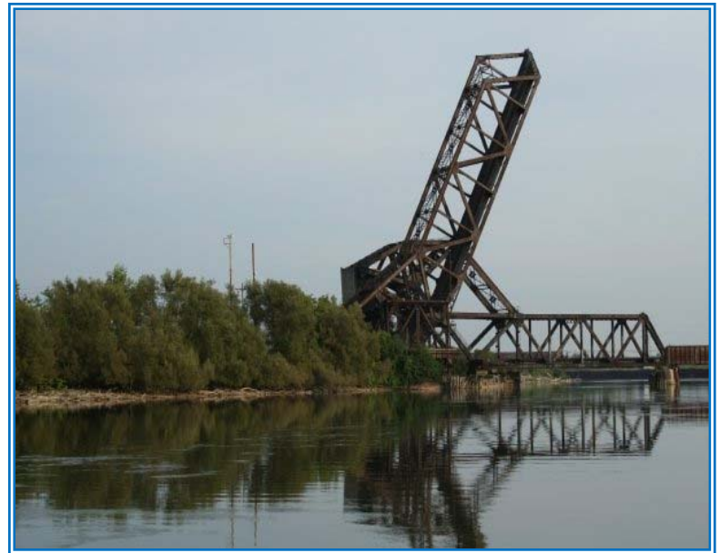
Elevated rail bridge crossing the Buffalo River near Smith Street, by Jill Jedlicka

A unique public-private-non-profit partnership including the U.S. Environmental Protection Agency (U.S. EPA), the United States Army Corps of Engineers (USACE), New York State Department of Environmental Conservation (NYSDEC), Buffalo Niagara RIVERKEEPER® and Honeywell is moving forward with plans to address a number of environmental problems affecting the Buffalo River. The environmental challenges include contaminated river sediments, poor water quality, a lack of safe public access, and insufficient fish and wildlife habitat. This partnership brings together diverse resources and expertise and has developed plans for a comprehensive cleanup and transformation of the river into a beneficial environmental, economic, and community resource.