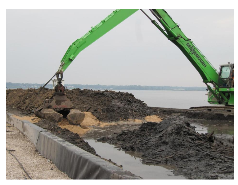
EPA contractors place contaminated sediment from Muskegon Lake in a drying bed. The dredging is the first phase of a Great Lakes Legacy Act project.

www.epa.gov/glla/dso www.epa.gov/glnpo/aoc/msklake.html