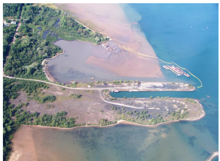
Aerial view of Tannery Bay. The dredging operation platform can be seen on the right.

The contaminated sediment was transported by barge to the MCM Marine location east of the Soo Locks. At MCM Marine, the water was allowed to drain out of the sediment and the water was treated at the site before being sent to the local wastewater treatment plant. The remaining material, containing chromium and mercury from a former tannery on the site, was then taken to nearby Dafter Landfill for disposal. The former tannery site itself was cleaned up under EPA's Superfund program in 1999.