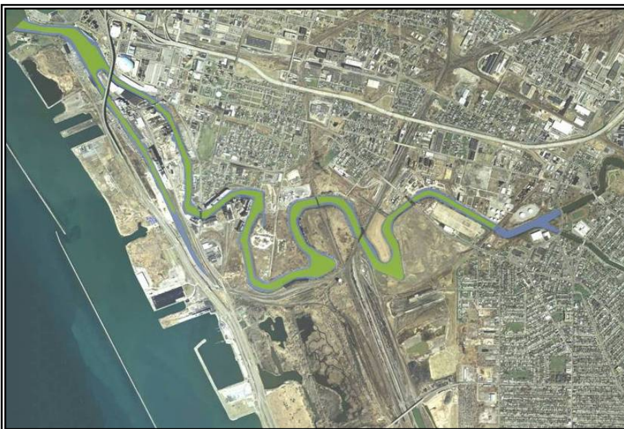
The highlighted portion of the Buffalo River and City Ship Canal represents the Buffalo River Area of Concern

This fact sheet seeks to promote awareness about the river, inform the public about plans for a cleanup effort expected to begin in the fall of 2010, and describe how the public will be kept informed and involved.