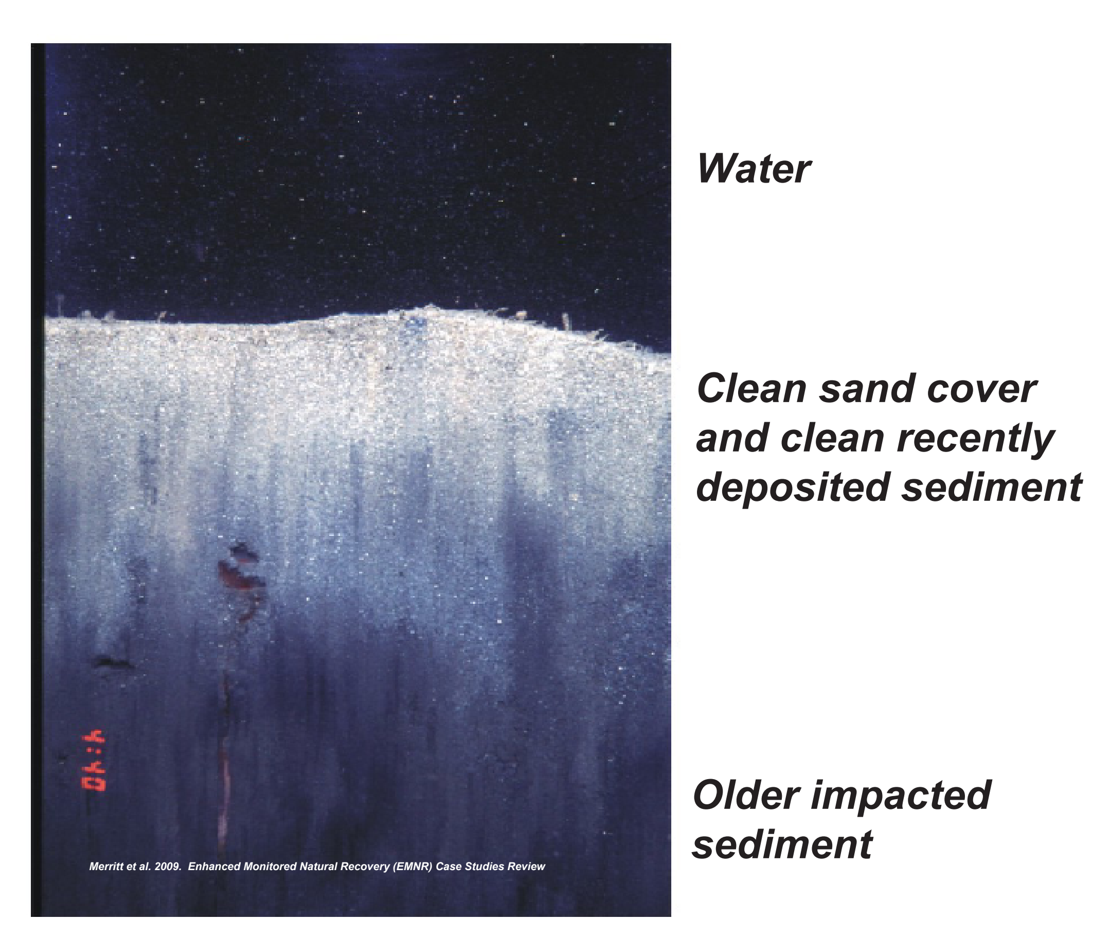
Conceptual example of ENR sediment cover.