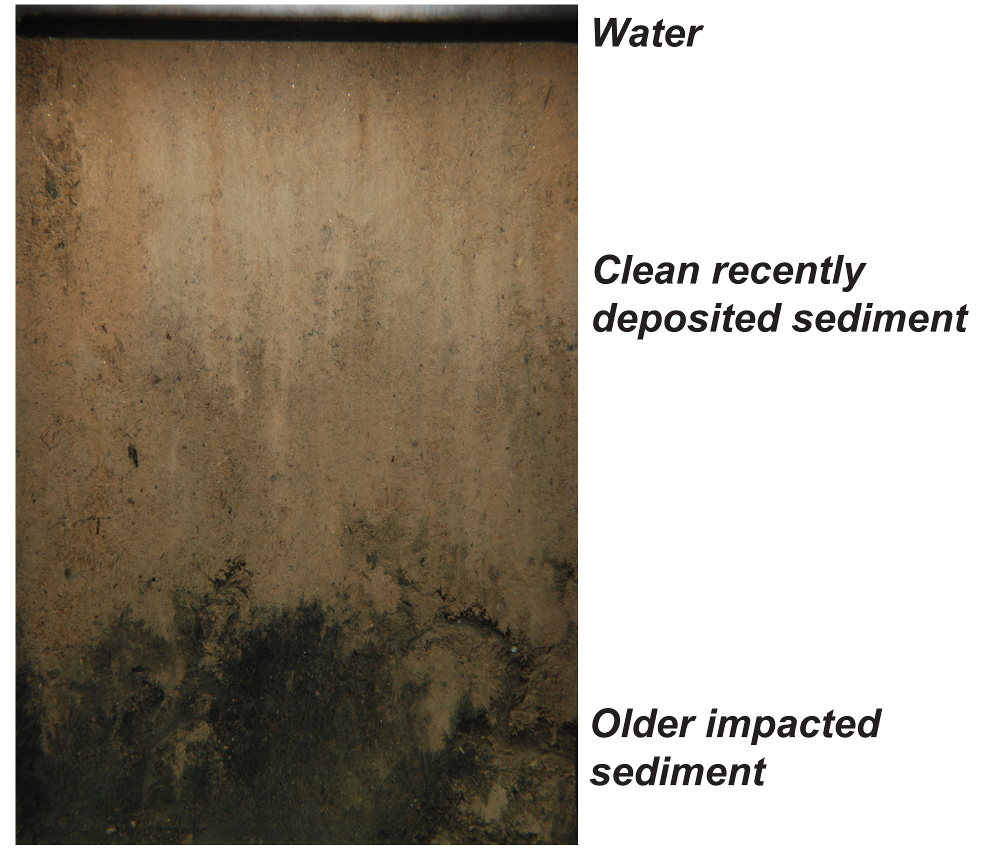
Spirit Lake sediment photograph.