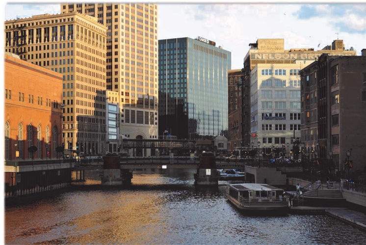
Downtown Milwaukee waterfront (WDNR)

The rich natural resources of the Milwaukee Estuary sustained native cultures and later drew European immigrants to settle its shores. As the area grew into a center for shipping, commerce and industry, the rivers were dammed, dredged, straightened, widened, and often lined with concrete. Over time, they were heavily polluted by industrial, agricultural, and urban sources, leading to their designation as an AOC.