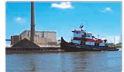
Menomonee River (UW-Extension)

The Wisconsin DNR and partners are working to clean up sediments, prevent excessive algal growth, control storm water pollution, improve beach water quality, enhance fish and wildlife populations, and restore habitat.