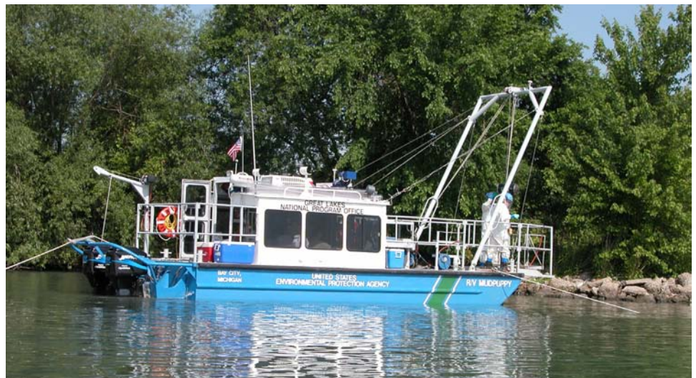
EPA's Mudpuppy was used to collect sediment samples from the Black Lagoon.