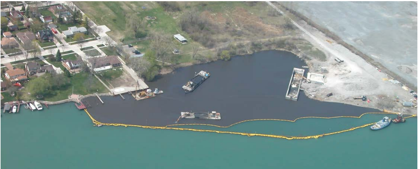
This photo shows the silt curtain that was constructed around the Black Lagoon to keep resuspended sediment from entering the river.