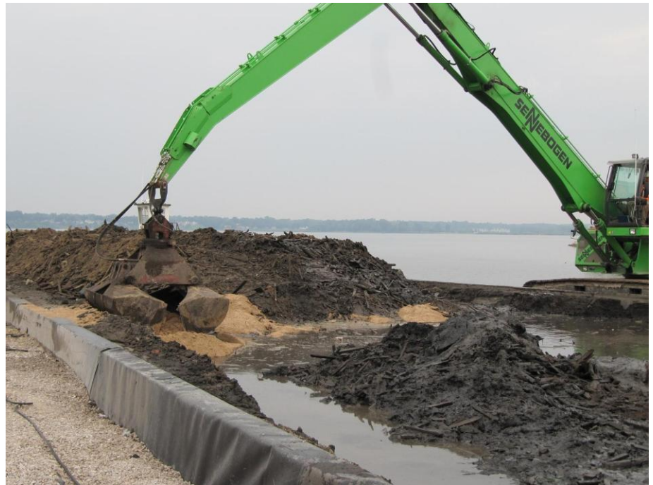
EPA contractors place contaminated sediment from Muskegon Lake in a drying bed. The dredging is the first phase of a Great Lakes Legacy Act project.

www.epa.gov/glla/dso www.epa.gov/glnpo/aoc/msklake.html