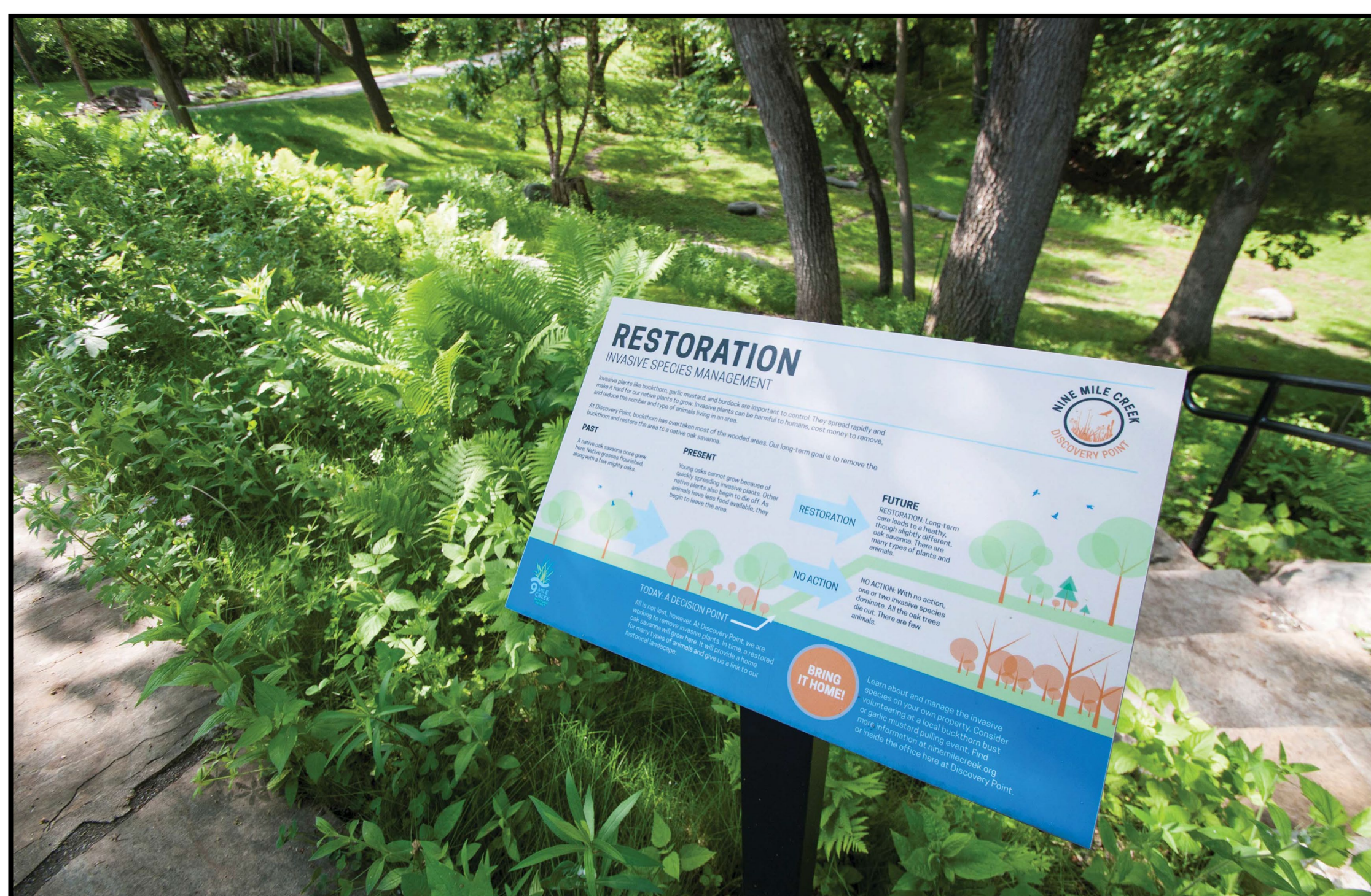
Conceptual example- Interpretative signage along trails.