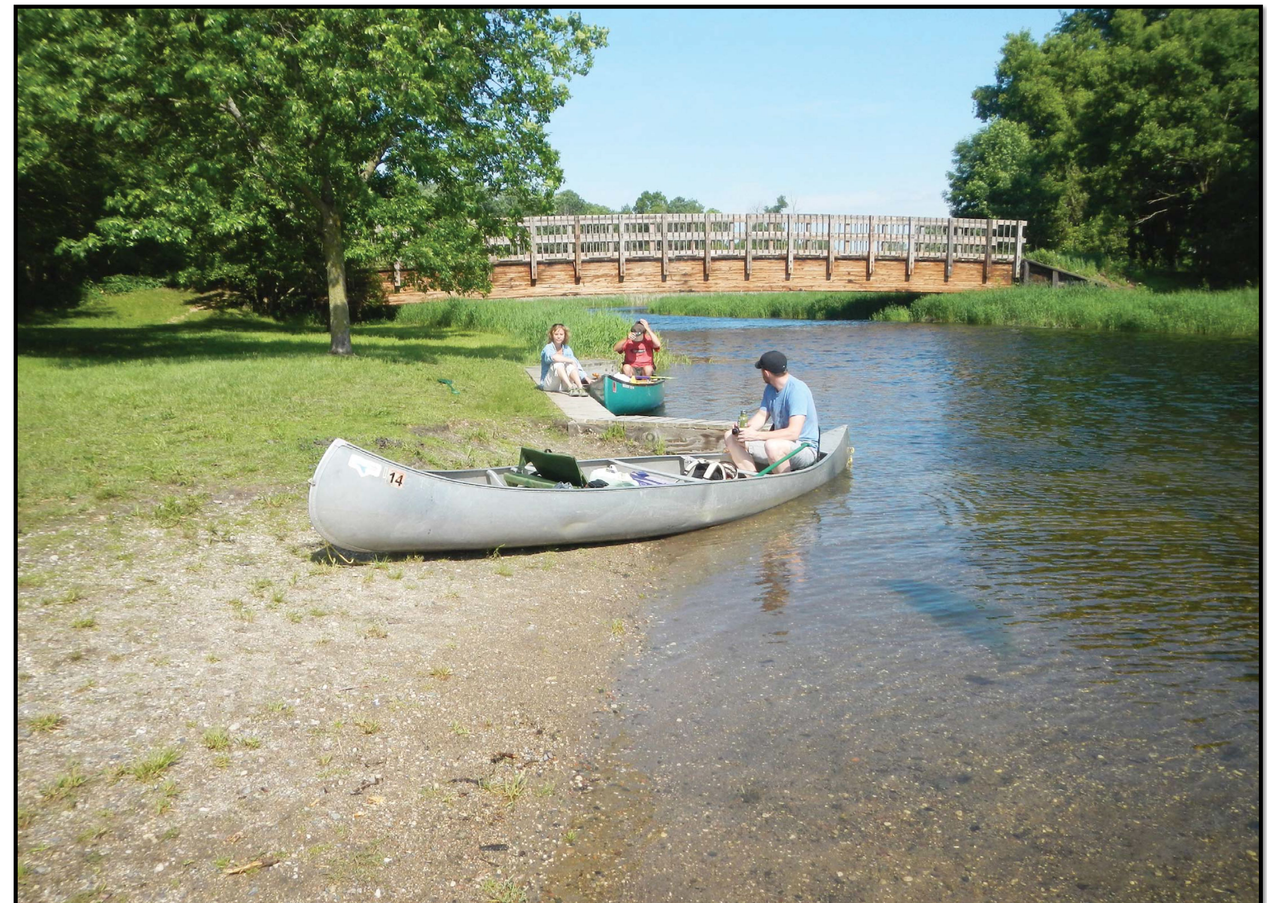
Conceptual example- Shoreline access and canoe/kayak landing.