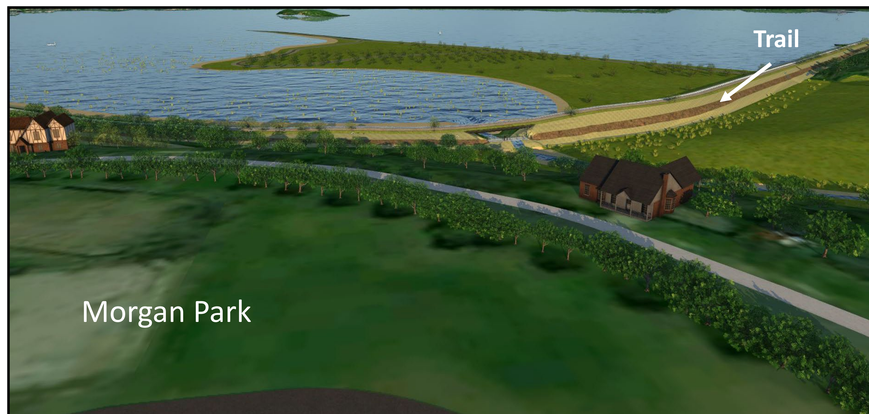
Conceptual rendering of view of the pedestrian trail and Shallow Sheltered Bay post-construction