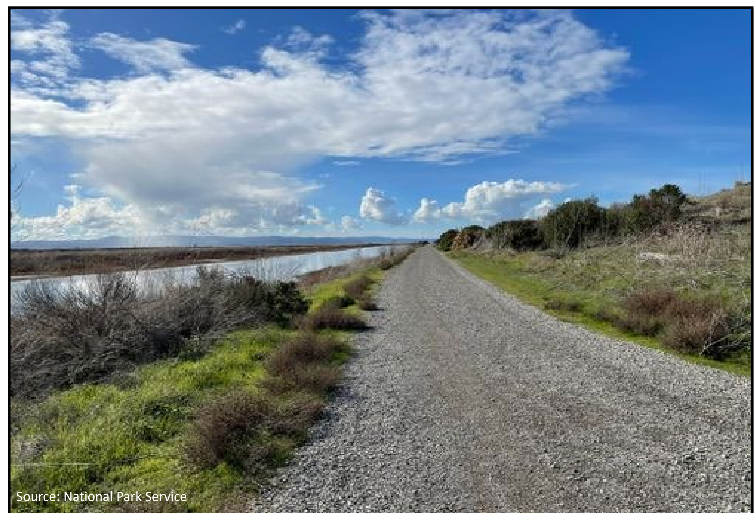
Conceptual example- pedestrian walking and biking trail.